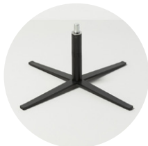
SB-700-N28 (fixing with plate)