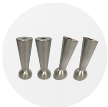
K8-900-000 (aluminum) M10 (x2 front +x2 back)