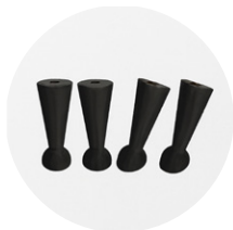
K8-900-000 (aluminum) M10 (x2 front +x2 back) K8-900-00E (black) M10 (x2 front +x2 back)