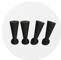
K8-900-0NE (black) M10 (x2 front +x2 back)