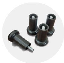
8CPI0005 M10 (x4 pz)