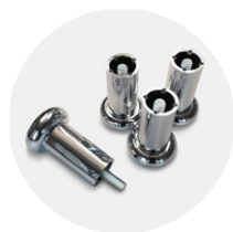
8CPI0005 M10 (x4 pz)