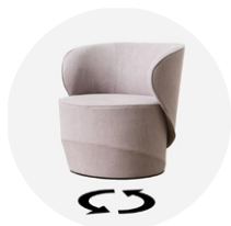
PL-SEL-002 armchair with swivel base