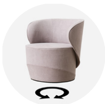
PL-SEL-003 armchair with self-aligning swivel base