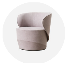
PL-SEL-000 armchair with fixed base